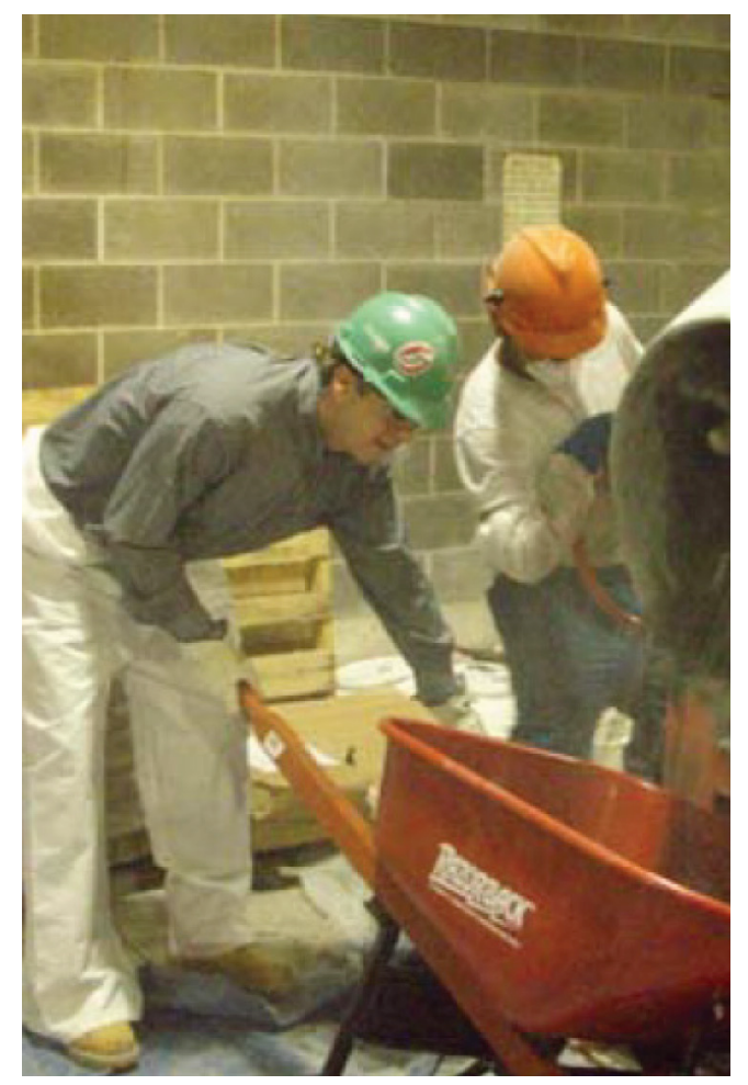
2. Mixing Tufchem Silicate Concrete

After over 15 years of service, TUFCHEM Silicate Concrete had out-lasted every other refurbishment material tested at the mill and was chosen again for additional renovations undertaken in 2007.